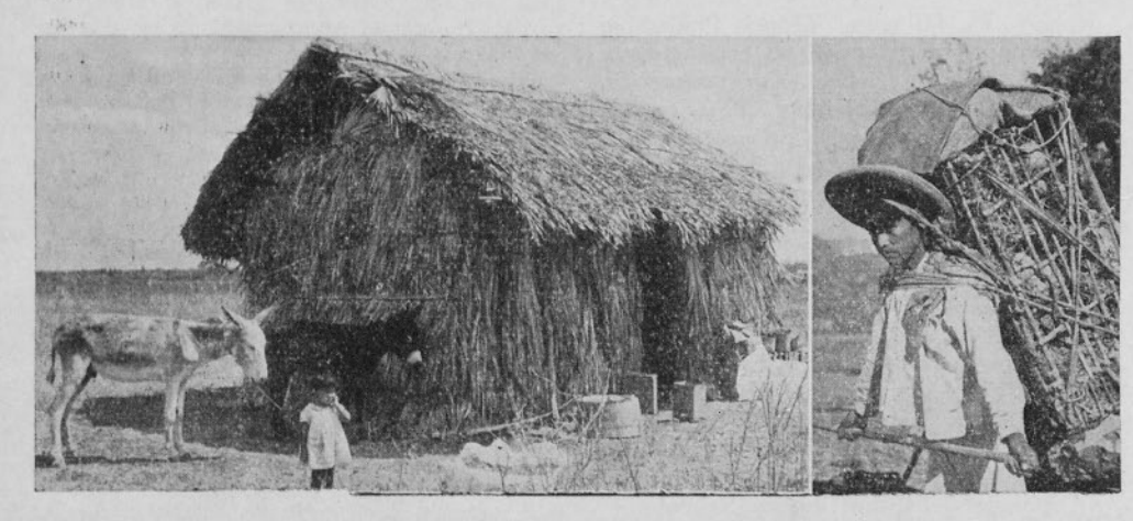
Left: Poverty abounds in Mexico. This is typical of many a home among the poorer classes—no floors, no windows and no chimney. The smoke must find escape through cracks in the wall. Right: A familiar sight in this "land of burdens."

After crossing by train to the Gulf of Mexico for a brief visit in the port city of Veracruz, we returned to Mexico City for our farewell services—the climax of six wonderful weeks during which we traveled from the Rio Grande to the Gulf of Mexico, and spoke more than sixty times. We have learned to love our neighbors whom we will long remember for their hospitality to the stranger.