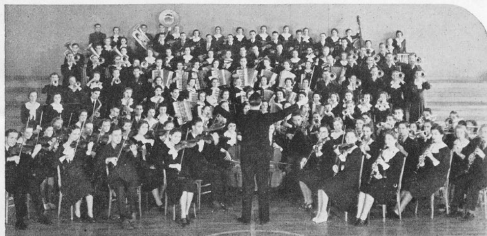
Musical training forms an increasingly large part of the program at Central Bible Institute. Some of these students are accomplished musicians, many are learners. There are several instrumental groups and several vocal groups in which young people can improve themselves—concert orchestra, brass band, string ensemble, choir, girls' chorus, male chorus, etc.—in addition to the private lessons; a place for everyone.

He told me of some of his spiritual prob- (Continued on Page Six)