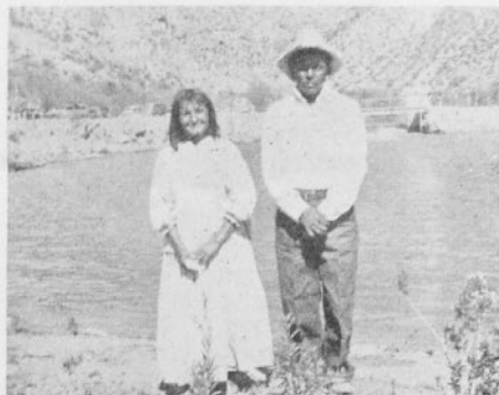
First converts among the Apache Indians on reservation near Globe, Arizona.