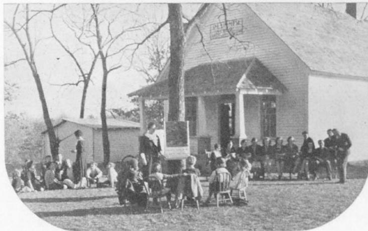
As many as 37 groups of students go out weekly to hold Sunday school and gospel services in country churches, school houses, jails and on street corners. They have ministered some Sundays to 1900 people. During the school year just ended 270 were saved, some were reclaimed, a few were baptized in the Holy Spirit, and quite a number were healed.

"Know ye not that they which run in a race run all, but one receiveth the prize? So run, that ye may obtain. And every man that striveth for the mastery is temperate in all things. Now they do it to obtain a corruptible crown; but we an incorruptible. I therefore so run, not as uncertainly; so fight I, not as one that beateth the air: but I keep under my body, and bring it into subjection: lest that by any means, when I