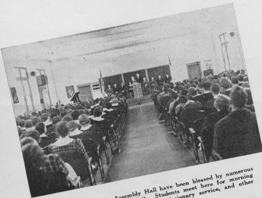
Services held in the Assembly Hall have been blessed by numerous outpourings of the Holy Spirit. Students meet here for morning worship, noon prayer, Friday night missionary service, and other times of worship.