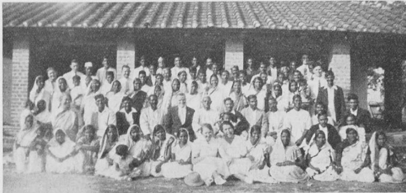
Convention of the native workers of our North India District Council, with a few missionaries present