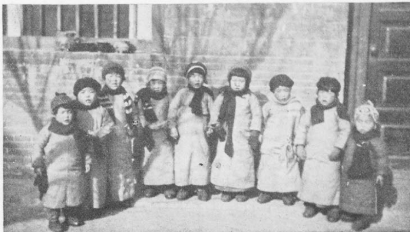
Young hearts provide good soil for the gospel seed. These little orphans of the Ta Chang mission in Shansi Province are reciting Scriptures they have learned.

"After communion service on Sunday morn-