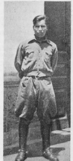
Native worker in the Peruvian army.

"Then we prayed for her again. In the natural there is absolutely no hope but with God all things are possible. Best of all, the girl herself is trusting Jesus for soul and body. Let us remember her in prayer, that God may be glorified in her.