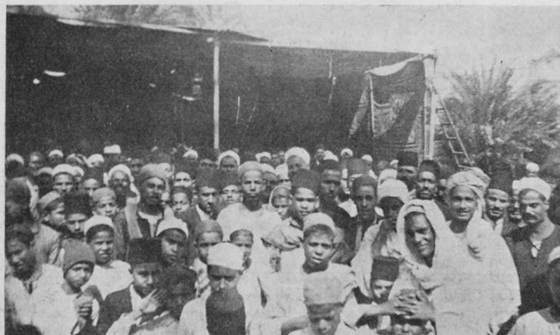
For these, light has shown forth in the darkness. Part of the great crowds that gathered for the recent convention of Egyptian workers and church.