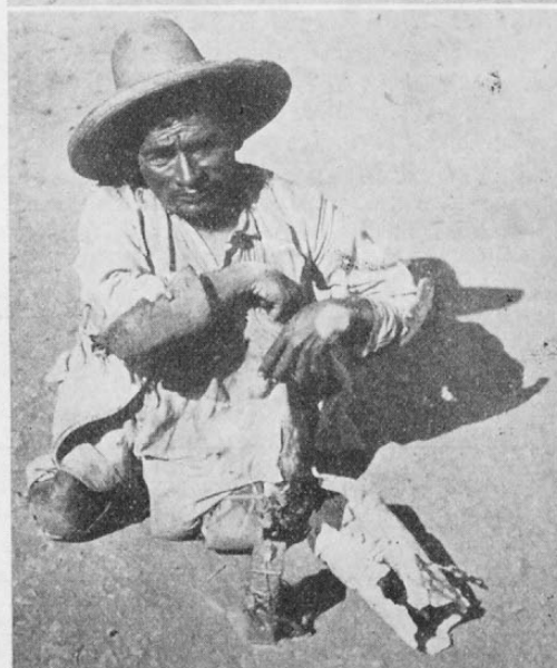
Slowly, slowly, on knees and elbows, mile by mile, inch by inch, this paralytic measures his length in the dust on the "dark pilgrimage."

We hastened forward to seize his hand and speak to him; he instantly recognized our voices, remembering our meeting of the year before. "And your companion," we asked, "the other blind man . . . where is he?"