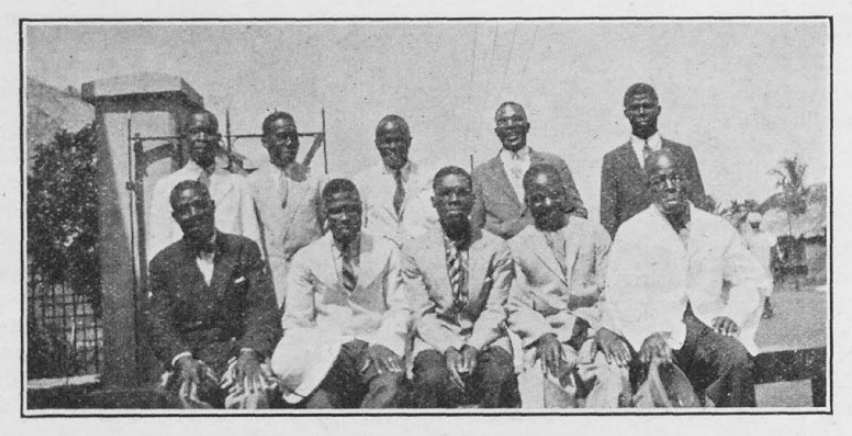
The native committee of the assembly at Freetown, Sierra Leone, West Africa

"Since the invasion of South China there has been much suffering. The fall of Canton has