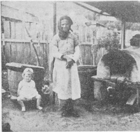
Now free from demon possession