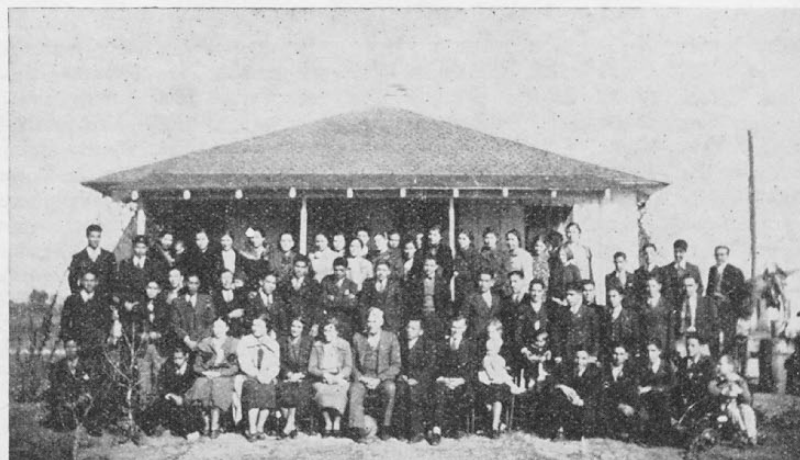
Our Latin-American Bible Institute, Saspamco, Texas—forty-nine students and seven teachers

These faithful workers will appreciate the prayers of their many friends in this country as they return to their work in China. They will be leaving the west coast February 18. Steamer (Continued on Page 12)