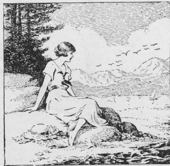
Fearing to launch on "full surrender's" tide, I asked the Lord where would its waters glide My little bark—"To troubled seas I dread?" "Unto Myself," He said.

We hear people say, "I promised the Lord so many things and failed, I was so weak." But He says, "My grace is sufficient for thee." Was it not the Spirit of God upon you that caused you to make that promise to God? Then you may be sure the same Spirit will be glad to minister strength to enable you to do the things that you promised. What victory, blessing and deliverance are brought when we do the thing that we promised the Lord we would do. We do not get very far in spiritual things until we do the thing we promised the Lord we would do. When we keep our vows, the Spirit opens our eyes and enlarges our vision and gives us a desire for a deeper place in God, and leads us on.