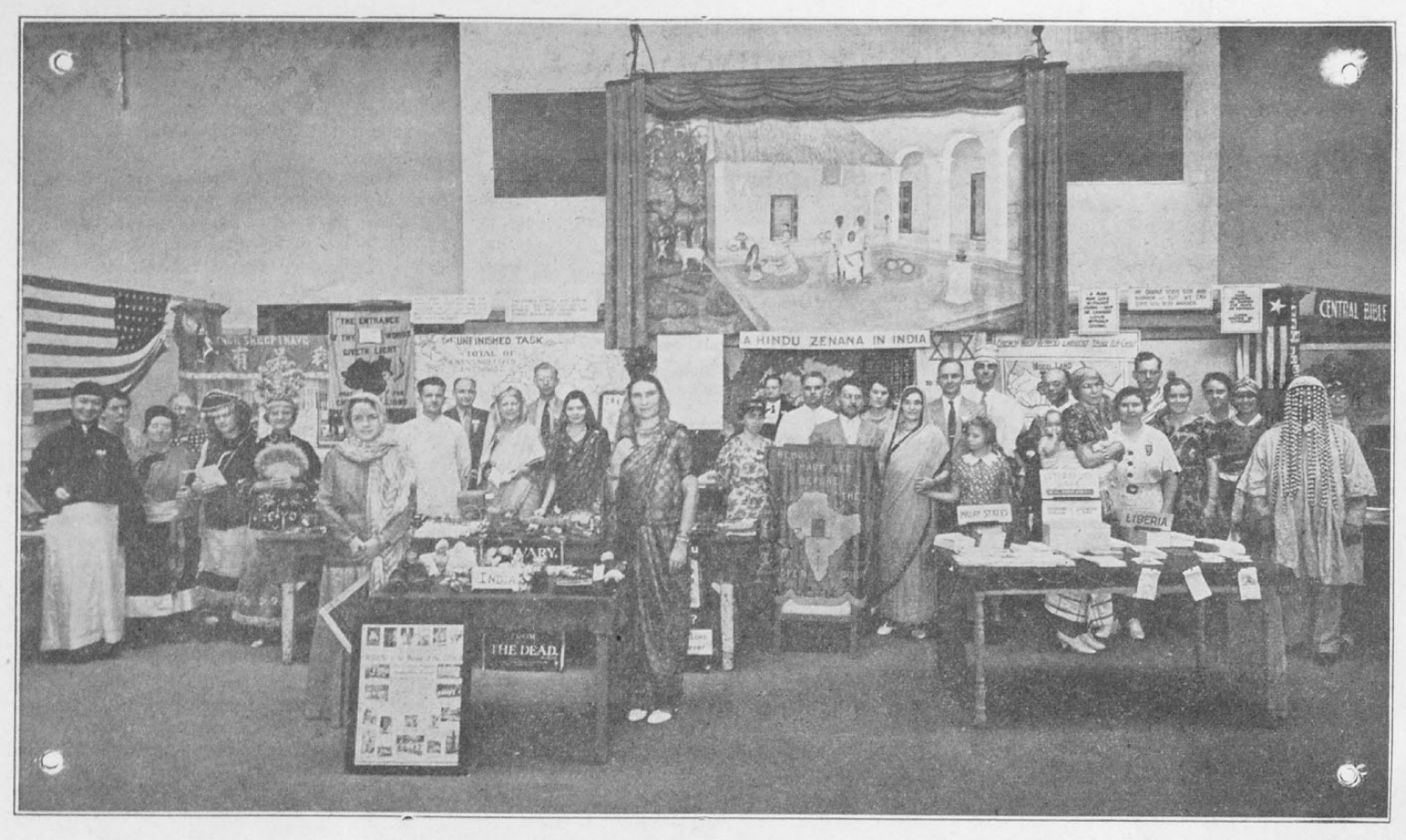
Missionary exhibit, together with a number of missionaries attending the General Council.