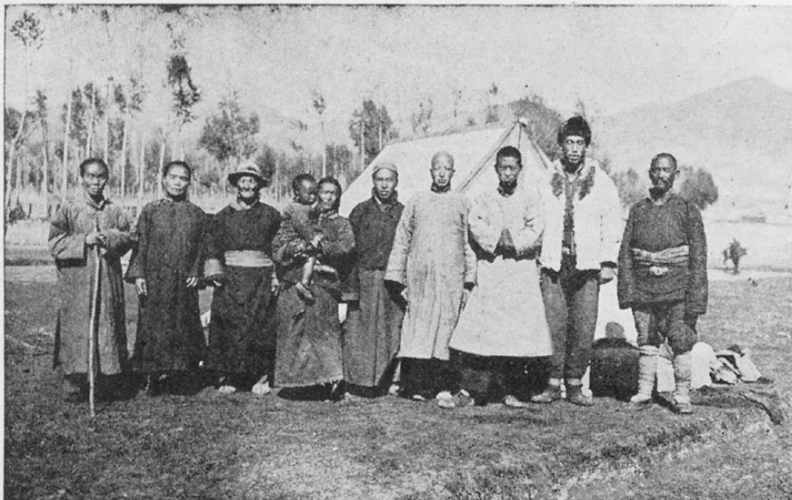
Christians who were baptized shortly before the close of last year. These Chinese and Tibetans have been serving the Lord for several years, thus proving their steadfastness in their stand.

Besides the above mentioned converts there is a couple who were baptized several years ago and who are standing loyal to the Saviour. The husband is always ready to witness among his people of the wonderful saving power of Jesus. He does not read, but one will find it difficult to corner him on most of the vital doctrines of the Bible. He listens when the Word is spoken,