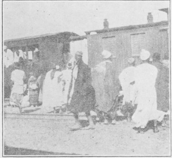
Typical native train, French West Africa

"While he conducted his reading class I went into the vard to greet the women. At first they were shy, but when they found that I could converse with them in their own language they came to greet me and called others from the surrounding huts to come. After greetings I told them to re-