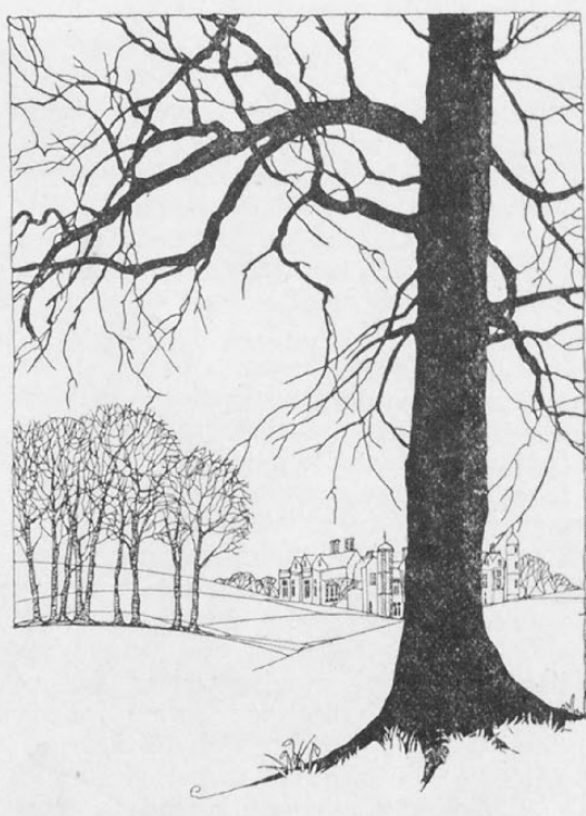
"Till He Come"

When they arrived where the eleven were gathered together with others, before they could tell their own story they were met by the story of what had hap-pened to this group. "It is true," they exclaimed to these two men who had just come in, "it is true that the Lord has risen, He has appeared to Simon." And while they were talking of these things, Jesus Himself stood in the midst of them and said unto them, "Peace be unto you." But they were terrified and thought they had seen a spirit. But He said unto them, "Why are ye troubled? and why do thoughts arise in your hearts? Behold my hands and my feet, that it is I myself: handle me, and see; for a spirit hath not flesh and bones, as ye see me have." And