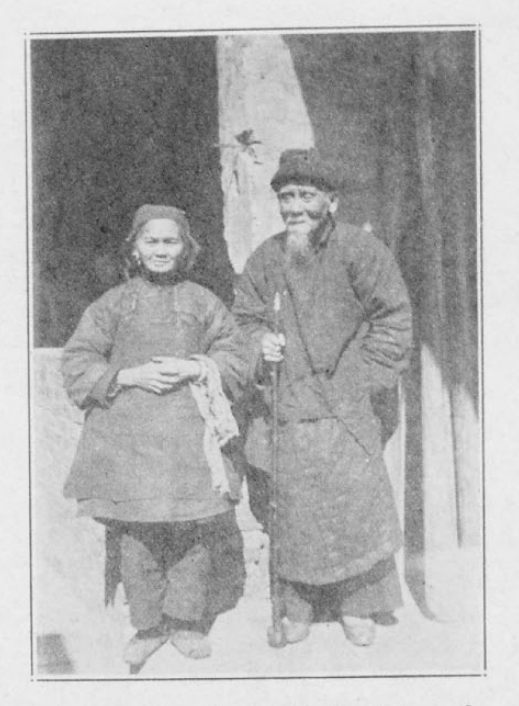
An aged couple in South China who recently heard the gospel for the first time.

Breaking into a new city with the gospel is not always the thrilling and gratifying experience that many imagine it to be. We sometimes hear of the people coming by