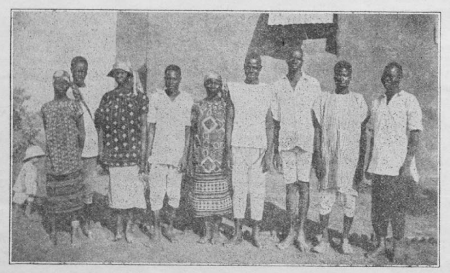
Workers who have regular preaching appointments in the villages near Yako, French West Africa

A glorious prayer and praise service was held in the afternoon, when one by one the natives reviewed their joys and sorrows, trials and victories, and how God had helped them to triumph. In the evening the power of God was graciously manifested, several received the Baptism with the Holy Spirit, and many others were blessed by the glory of His presence.