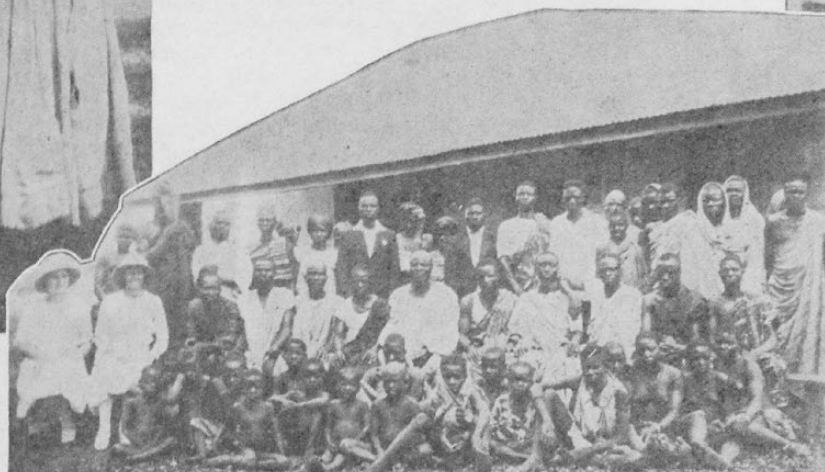
A Sunday morning congregation, Gold Coast