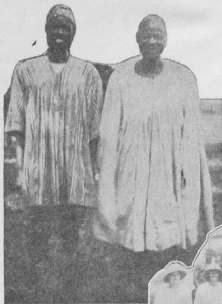
Konkomba and Dagonba chief, both sincere inquirers of the gospel.