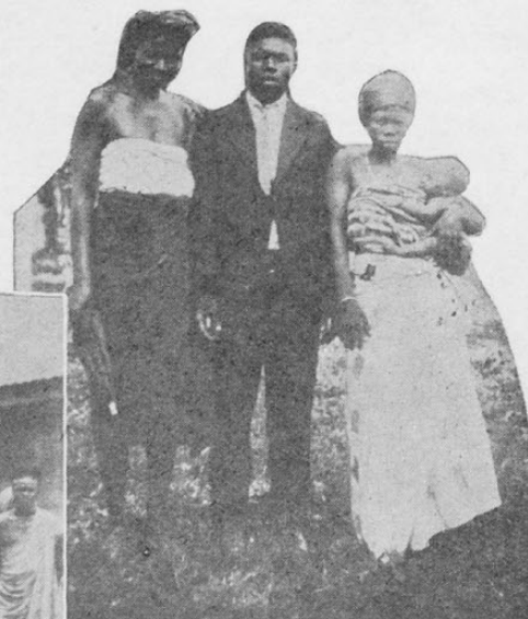
Native evangelist with his wife, child, and mother. This young man was recently ordained for the ministry.