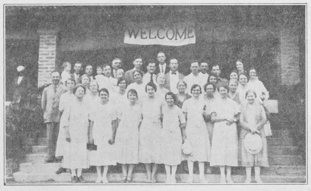
Missionaries present at the North India District Council Meeting held at Bettiah

Everywhere we go our heart is moved by the warm spirit of love and Christian fellowship which prevails among the brethren, and the Texico District was certainly no exception to the rule. The brethren very