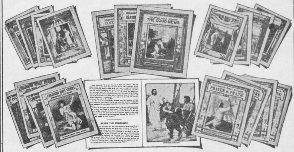
Each book is embellished with twelve or more pictures of Bible scenes in soft, pleasing colors

The fondness of children for color is a proverb. A story-book without colors lies dead on the shelves. Pictures of Bible scenes are used in illustrating "Childhood Bible Stories." Beautiful, attractive, instructive! Remember that good pictures and stories are stronger than anything else in molding the character of children. Excellent for gifts and rewards. Children will treasure these charmingly written and beautifully illustrated stories. Over two million assorted copies have been sold. Yet the circulation is just in its infancy, and the present demand conservatively points to a sale of many million. The stories are suitable for children of varying ages from four to nine years.