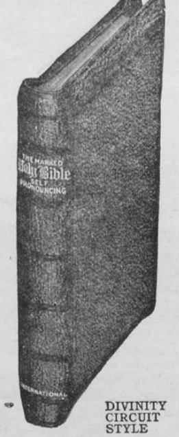
A Complete Teachers' A Complete Teachers' Bible containing Helps to Bible Study, including a full Encyclopedic Concordance, Subject Dictionary, etc., etc., prepared in simple language, printed from bold face type, profusely illustrated. Printed from large, clear, easily read type. Self-Proeasily read type. Self-Pronouncing. Size 5 x 734 ins.

The Gospel Publishing House, Springfield, Mo.