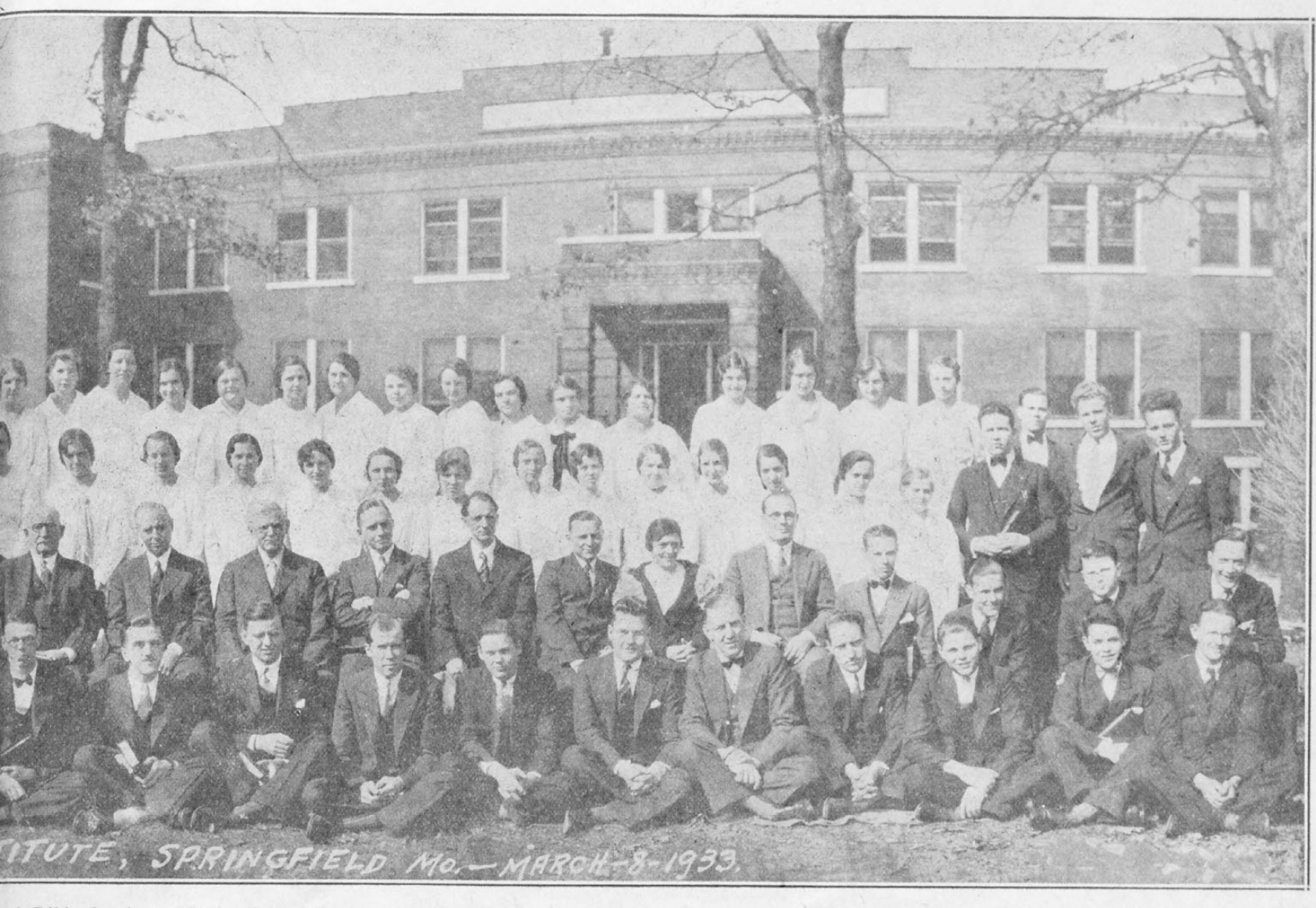
ral Bible Institute, Springfield, Missouri

might receive the grace of God in vain, not allowing God to work out its fruitage in one's life. The excellence of receiving not the grace of God in vain is "giving no offense in anything, that the ministry be not blamed." May you develop a sensitiveness toward your ministry, so much so that you would find it more pleasant to accept a personal slight or an attachment of blame to yourself than to have unfair and hurtful criticism made of your ministry. It may be personal with me, but long ago I found it easier for me to accept a personal slight or unwarranted criticism rather than to have my ministry blamed and handicapped, for I count my ministry the most sacred and valuable thing I have in life. May you ever hold your ministry in high esteem. There have been Christian workers who have so deported themselves as to give offense that has resulted in their ministry being brought into reproach. Prayerfully do we admonish you that you ever seek to avoid such.