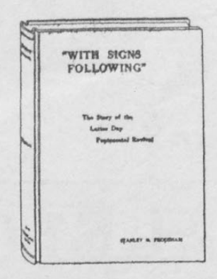
"WITH SIGNS FOLLOWING" The Story of the Latter-day Pente-costal Revival