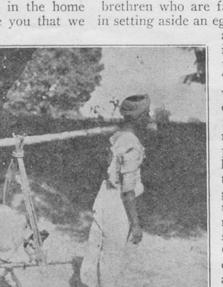
Transporting a little girl who has been injured. This is a typical Indian ambulance

the bungalow, got her little dolly that had been sent all the way from America, and brought it out and laid it in the arms of the little sufferer. It was all she could do but she did it gladly and the little ging the 'White Baba' to her bosom. Each day she had to be carried back and forth to have the sore dressed and this "Pray for us. God is wonderfully pouring in His life these days and we are