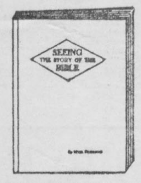
SEEING THE STORY OF THE BIBLE