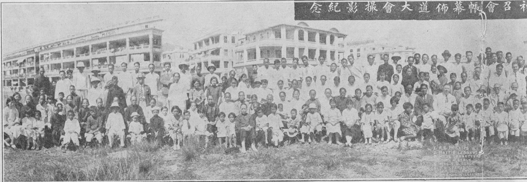
Some of the people who attended the tent meetings of our South Ch