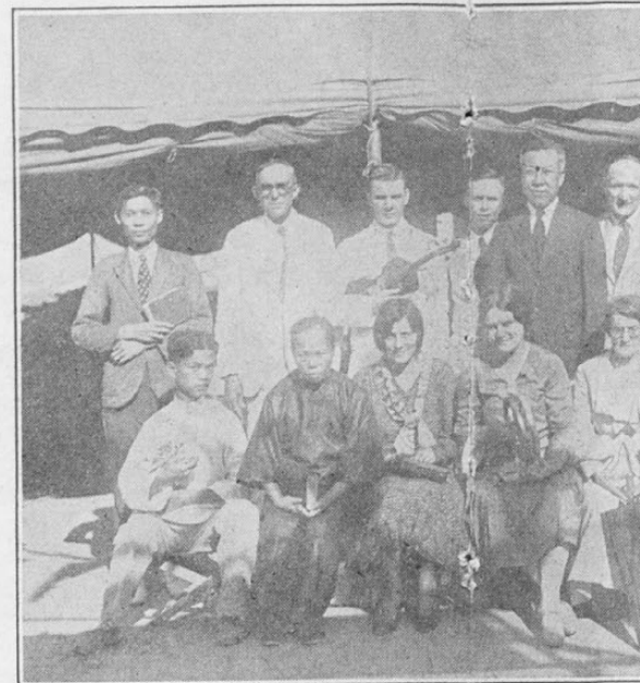
Missionaries and Workers at the South Ch