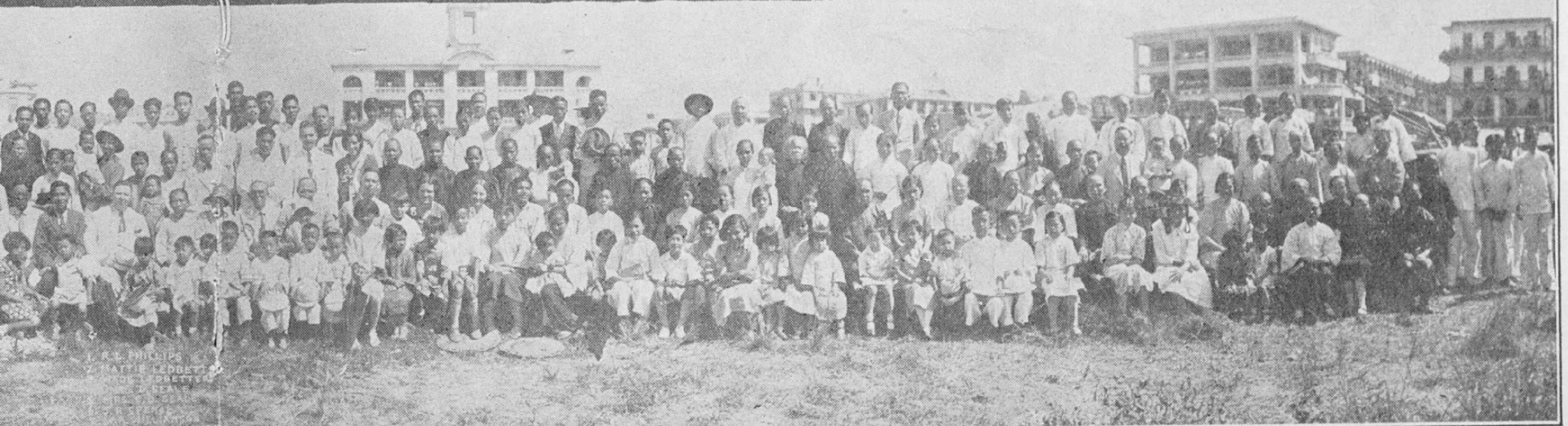
meetings of our South China District Council in Hongkong, South China