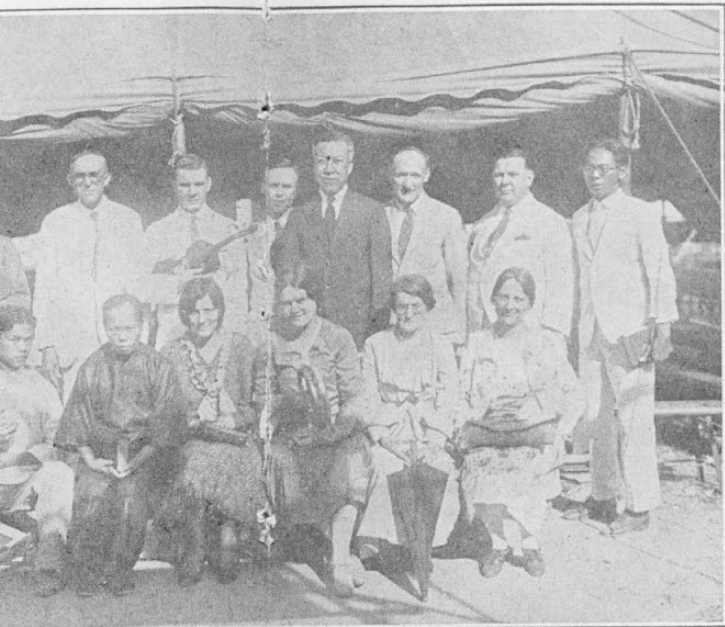
missionaries and workers at the South China Tent Meetings