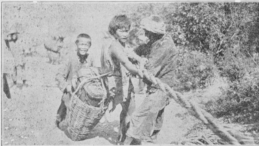
This picture shows native prepared to cross swollen river in Southwest China. You will note the heavy rope tied around his body which carries him across.