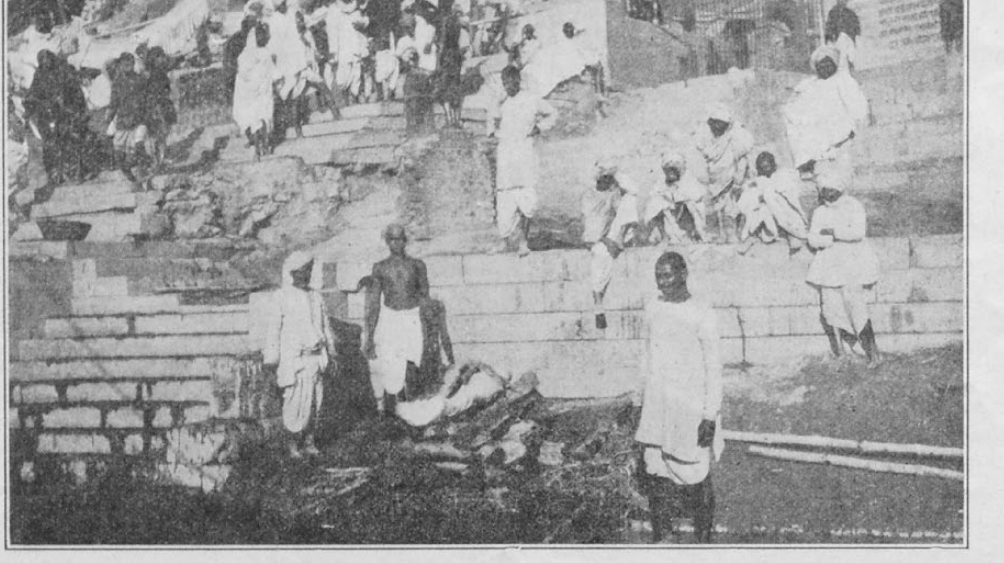
Preparing the funeral pyre on which the body is burnt. It is by throwing herself on the blazing fire that the little Indian widow has her one hope of salvation, according to their teaching.

Will you take these hidden ones on your hearts for prayer? And will you also pray for these converts in our training school who are rejoicing in the "so great sal-