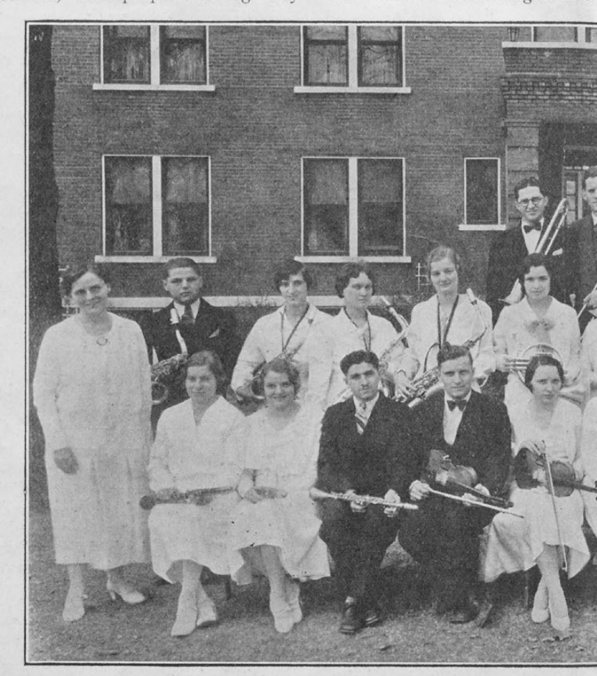
Orchestra of the Central Bible Institute. Write now f year courses at the C

After a number of year in Buenos Aires word car 30,000 inhabitants where ing. He had been there is sult of his labors he had o teen people, eleven of then poor men, earning but a came so discouraged that