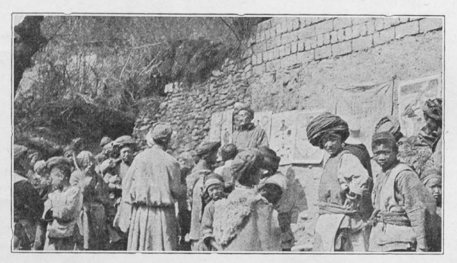
Preaching in the villages of Yunnan, China