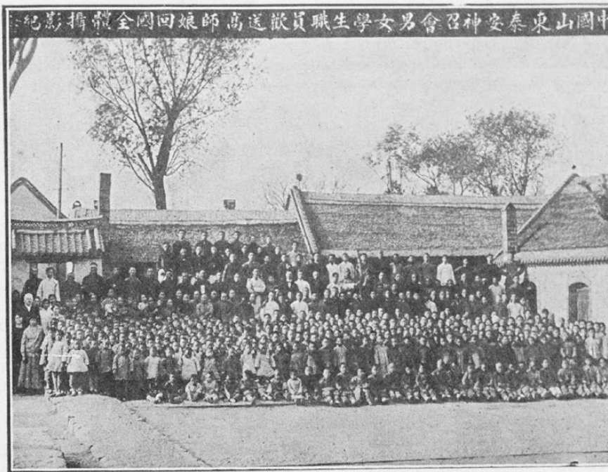
Workers and children at the Home of Onesiphorus, China