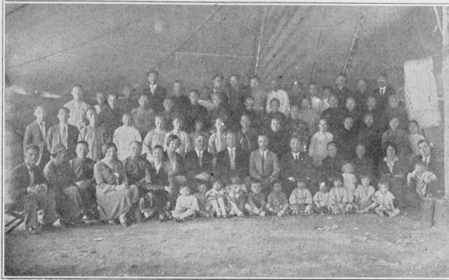
Chinese ministers, delegates, and missionaries at the recent meeting of the Chinese Council in South China. Great blessing attended the meetings.

Knowing their ruthless methods of killing and sharing the spoils, also their little tolerance of all opposition we reassured ourselves of His promises, reading Psalm 91 and committed ourselves into His care having great assurance that though the weapons of our warfare are not carnal yet they are mighty in God. During the day we heard the sound of doors being broken and also reports of various known persons' being killed because of resistance, and as the