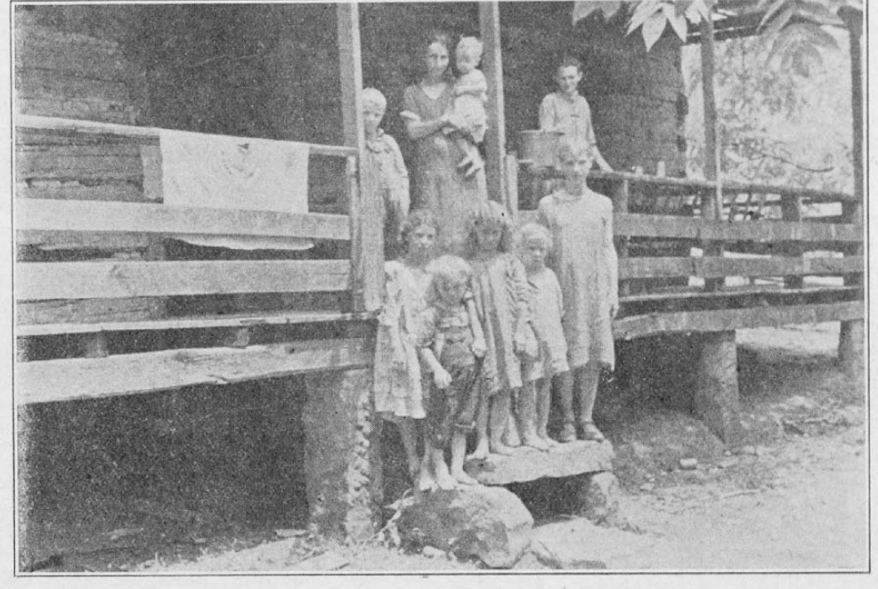
A typical Kentucky mountain family, although the father and two boys are for the moun- not in the picture. Their home is a two-room log cabin chinked with mud. tains. In the lit- The people are generally thin and gaunt.

On Sunday when I got there I found the little room full of men and boys who had come to hear me read. They could not read. That was the first time I ever tried to teach the Bible, and I shall never forget it. I sat on the lard can for they had no chairs; but first I knelt in prayer and I realized that prayer had (See Page 8)