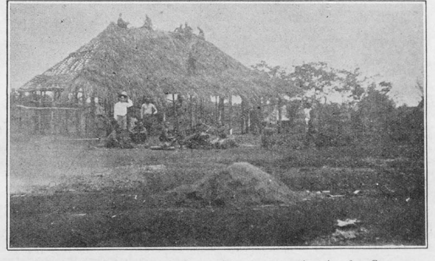
Native chapel in course of erection at outstation in the Congo