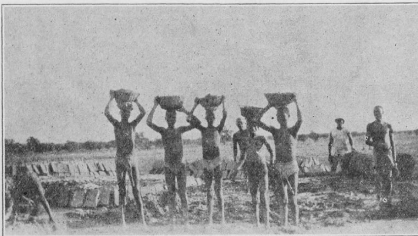
Building a house in Yako, French Sudan. The men are carrying mud in their baskets for mortar and brick making

Three of our Christians had been going to a certain village (the home of two of them), and witnessing to the people. The Catholics at once visited that village and told the people that there would be trouble for them if they consented to the coming of the Protestants and that they should refuse to listen to them. They even had one of the leading chiefs to warn them to the same effect. If left to the natives alone, this might have closed the door to that village as the natives fear the Catholics, knowing that most of government officials are Catholic as are also many of the chiefs. A visit by the missionary, who told them that the law allowed them to worship God as they chose, inspired confidence be-