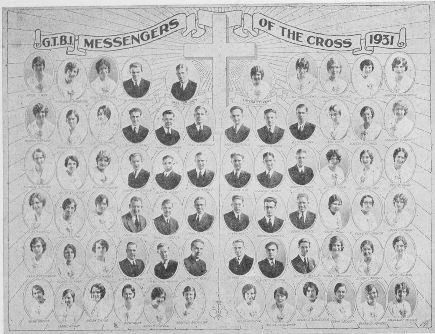
Graduating Class, Glad Tidings Bible Institute, San Francisco, Calif., 1931