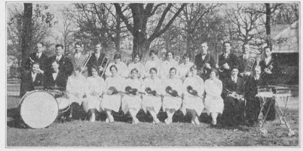
CENTRAL BIBLE INSTITUTE ORCHESTRA

The student in course A or B will be allowed to (Continued on Page Thirteen)