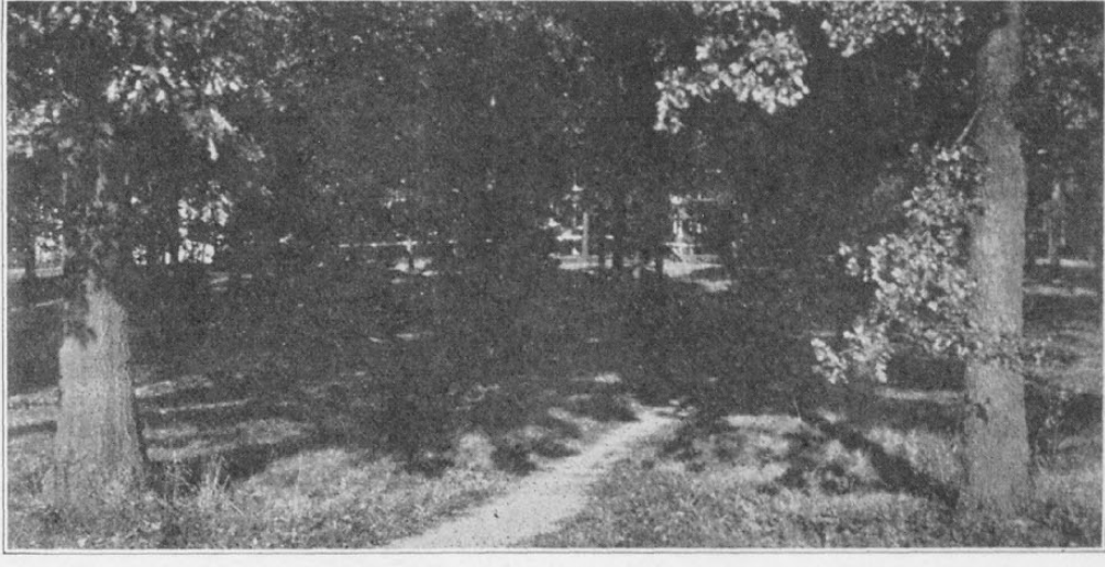
PATH THROUGH THE GROVE