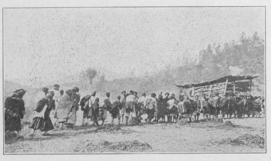
Lisu Christians on their way to church

instead of seats for them, while meetings were in process, and they also provided bedding at night. The people came from many districts, and we were so blessed to hear the different ones testify of what God had done for them since they had put away their idols and started to serve the only true God. One woman said that when the Tibetan robbers came and were stealing her grain, she fell on her knees