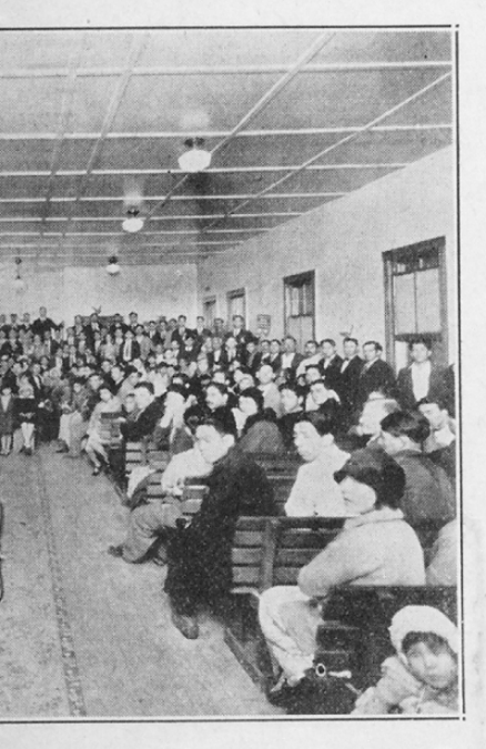
as in the Latin American work at as taken during the recent meetings

from America where I had spent hat when I arrived in Assiout the hildren again would not be spoiled . We get the mail about 8:30 a. m. p. m. The morning of my arrival orphanage treasury, but that morn-Johannesburg, South Africa, en-