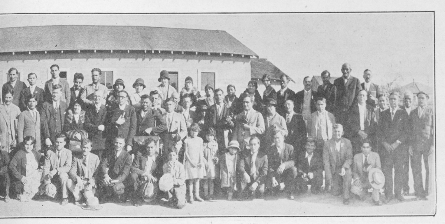
semblies of God in the United States held in the city of San Jose, California.

things, worth perhaps over $100.00 nths before, and before she died she ngs in her storeroom to the orphan-