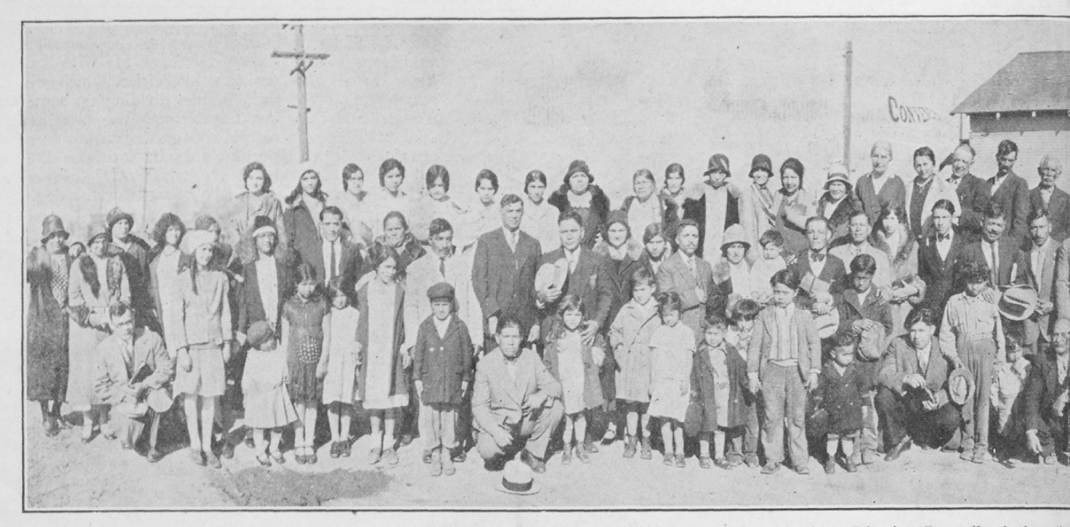
The second annual session of the Latin American District Council of the As