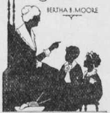
GOPEL PUBLISHING HOUSE SPRINGFIELD, MISSOURI

All the chapters tell about the same group of boys and girls in a most interesting school. The reader is first introduced to Granny-Tell-A-Story and the Twins and the "Joy Shop," and then through them to a most delightful time.