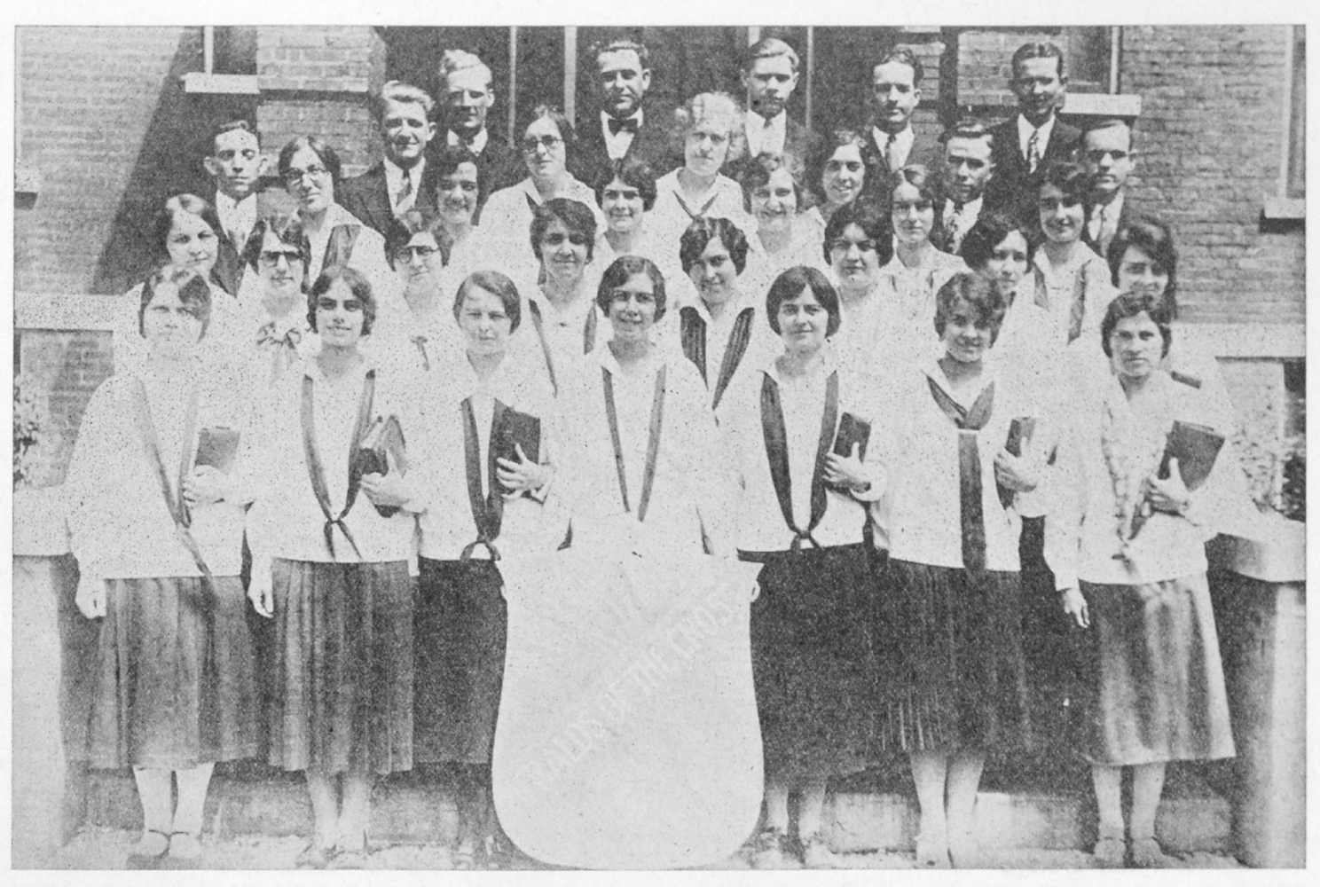
Graduating Class of Central Bible Institute, Springfield, Mo., 1930

is greatly enjoyed. The finale of the year and the good-bye fellowship time, is the so-called reception which is held at the School immediately following the commencement exercises. This is in reality "open house" down at the school for all friends who care to come. These are all seasons of mental relaxation and social enjoyment, but a strong spiritual note pervades them always. The presence of Him who said, "Come ye apart and rest awhile" is ever near and He is constantly worshiped and praised.