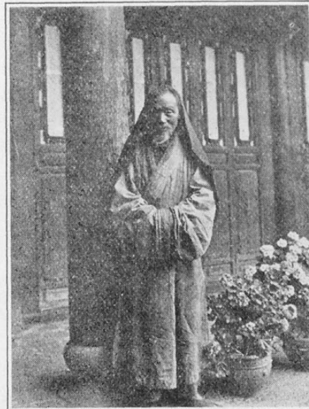
Buddhist Priest Who Is Seeking Light. Pray for Him.

It has been a great delight to spread the gospel in many of the villages around Likiang, and many people have expressed their desire to have a mission hall in their villages. We are very sorry that this work cannot continue, but the rainy season has hindered us. Still we believe that there has been some good results and some have been moved about their soul's salvation and we are earnestly looking forward to the time when we shall be able to resume our village work better equipped than we have been this past season. Our pressing need is a suitable tent, storms hinder us, and it is not easy to control a vast crowd on the public square.