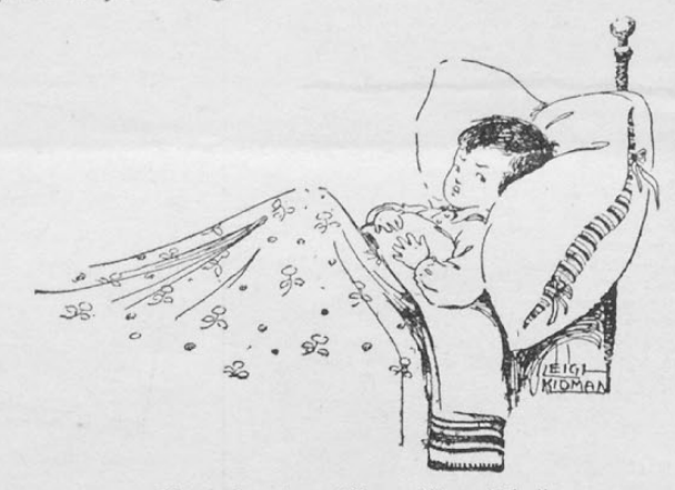
Illustration from "Sleepy Time Tales"

Almost forty of the charming stories which this writer tells to the continued delight of the little folks, make up Sleepy Time Tales . More than eighty pictures and an artistic cover in color add much to the book's appeal. Sleepy Time Tales has just been completed and there is a copy waiting for your boys and girls.