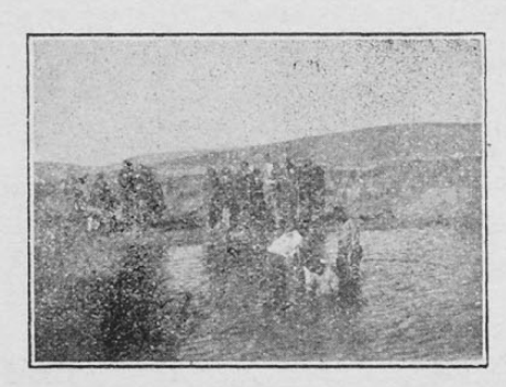
Baptizing native converts