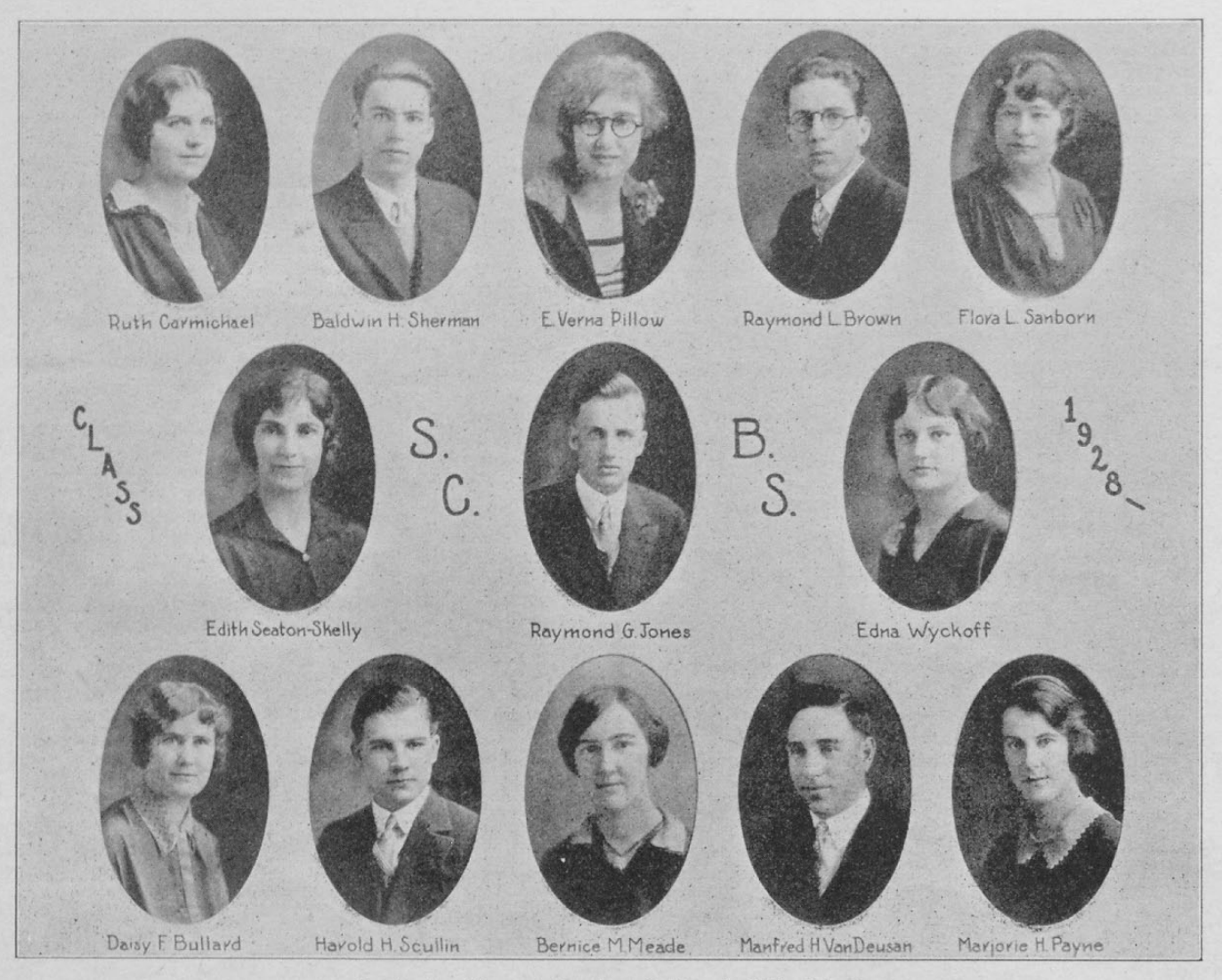
Graduating Class of Southern California Bible School