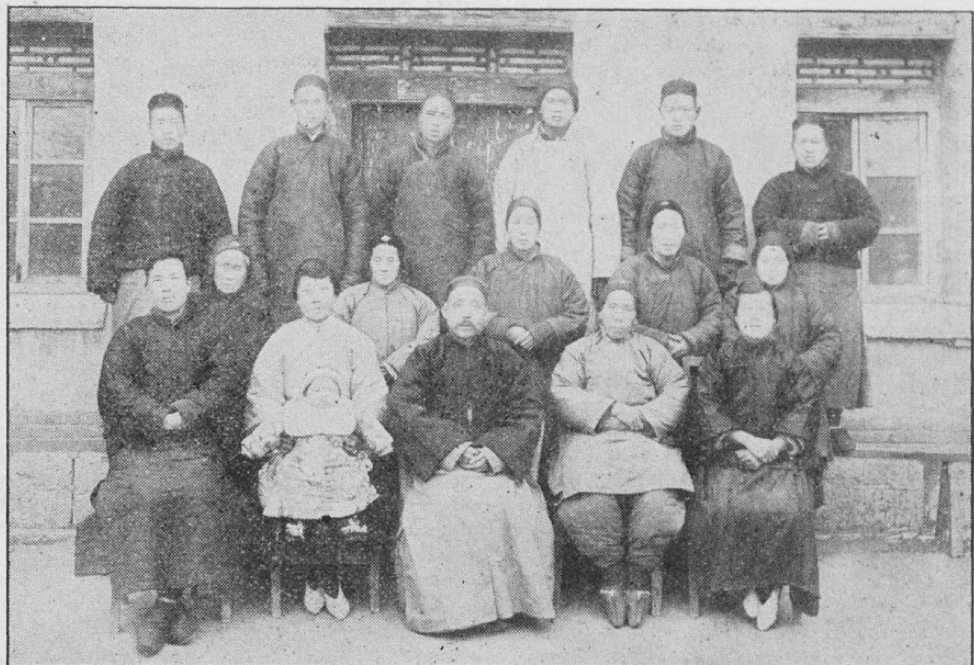
Lung Shan Workers