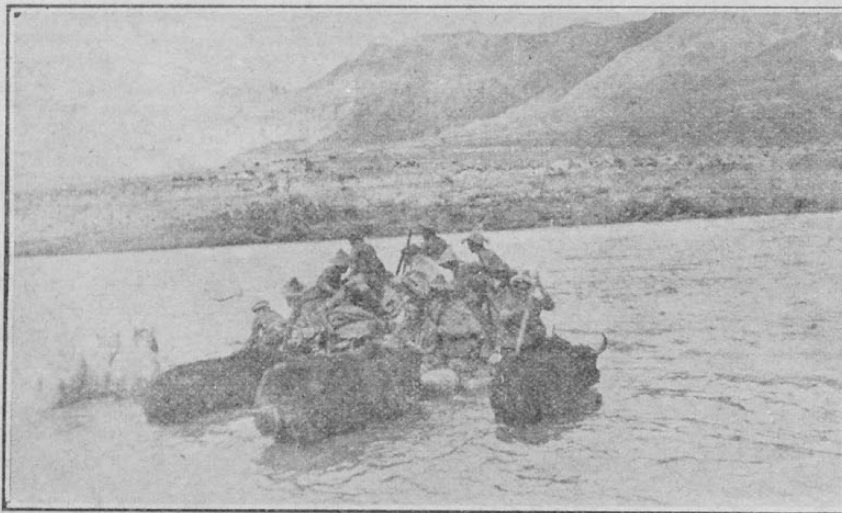
Crossing a river in West China

At first I could not understand why God had sent me to such a small place. But since He has given me such a vision of the possibilities of country evangelism from this center, I realize that more can be done here than even in the corner of a large city. This is a junction of railroads, and fast electric lines in four directions. Also there are many auto bus lines that run into the villages which are off the railroad. There are endless possibilities to get by easy transportation to towns and villages in all directions. Some are as large as this one, some only slightly smaller. Almost all are entirely unevangelized; only two of the larger towns have one little sleepy denominational church in them.