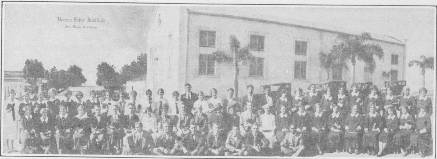
Students and Faculty of the Berean Bible Institute, San Diego, Calif.