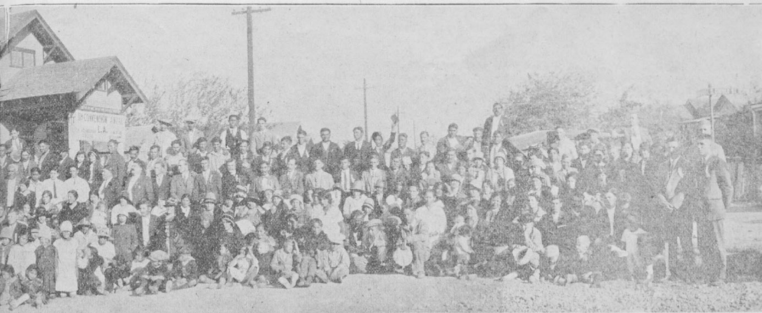
Annual Latin-American Conference of the Assemblies of God.

filled Mexican believers. It was encouraging to behold what the Lord hath done in a dozen short years, beginning with one high school lad the harvest use this picture to speak to Christians who are standing 'all the day idle.'