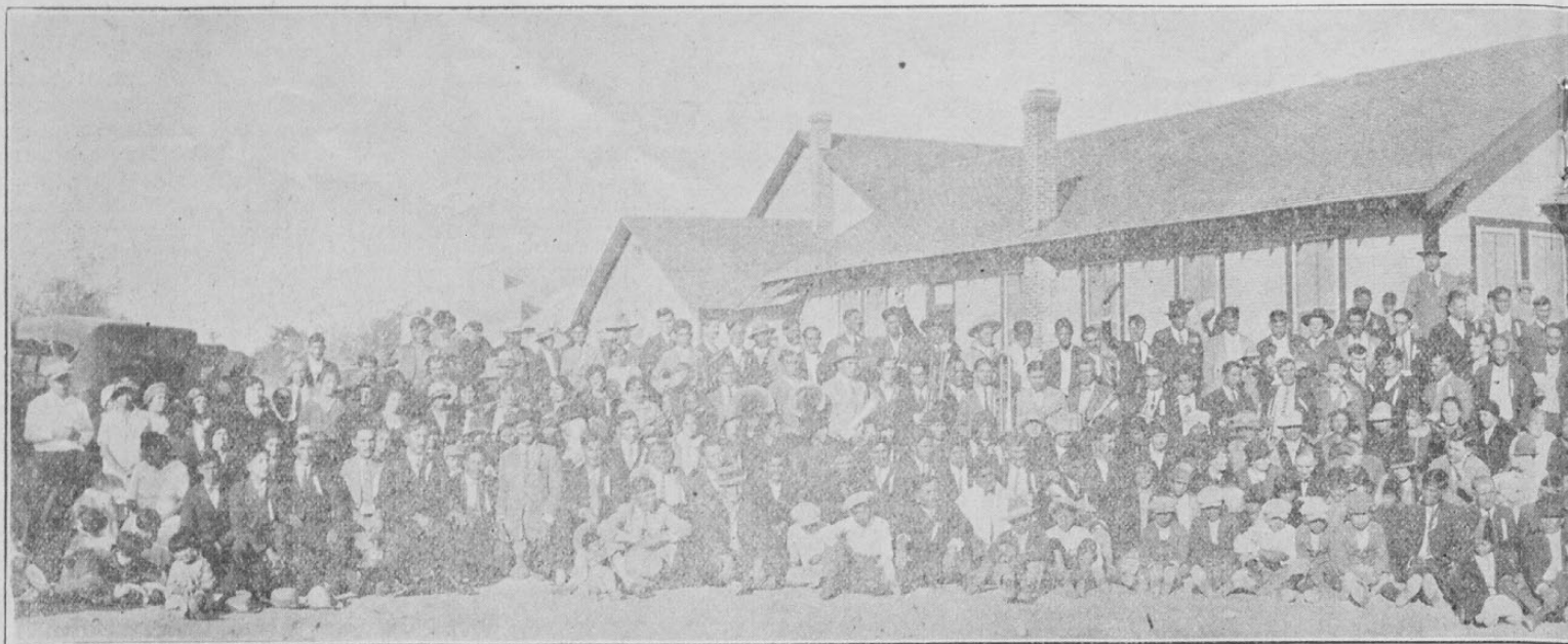
The Ministers, Delegates and Visitors attending the Eleventh