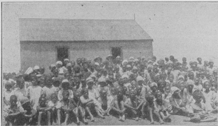
Randfontein Sunday School