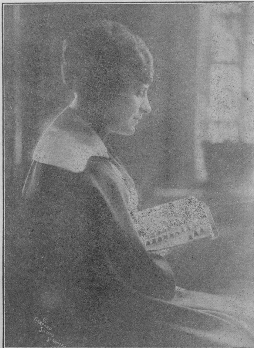
EVANGELIST AIMEE SEMPLE MCPHERSON

Subscription Price $1.00 Canada and Foreign $1.50