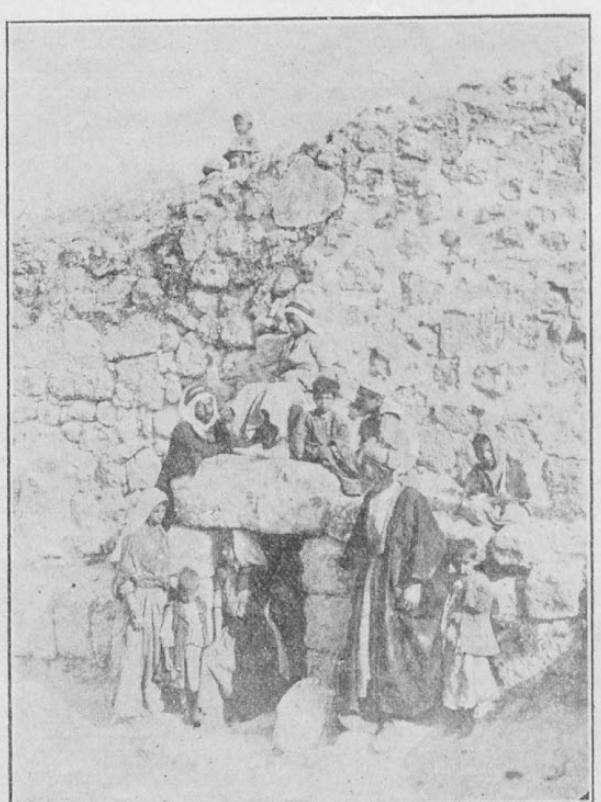
A Close up view of what is believed to be the tomb of Christ

But one day there came a money crash and their wealth was all swept away.