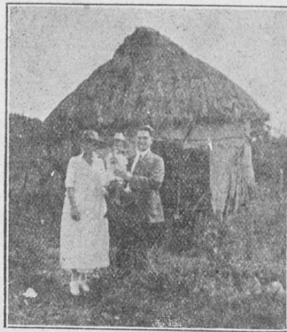
Brother Frank Finkenbinder, wife and child.

It is only some eight years since the Pentecostal truth began to be preached, and that under great difficulties, since the workers were few in number and without means to help to advance the cause. Not a single Pentecostal church building, even until today, stands in either town or city, that is property of the