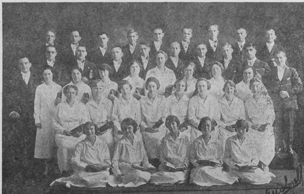
Glad Tidings Bible Institute Graduates, San Francisco, 1924