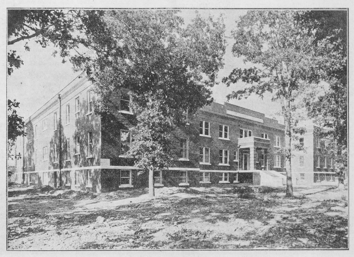
THE NEW NEARLY-COMPLETED BIBLE SCHOOL

Subscription Price $1.00 Canada and Foreign $1.50