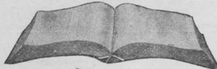
Note the open-flat feature

Printed from large clear type with marginal References, containing Family Register engrossed in gold and red and colored Maps.