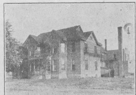
THE GOSPEL SCHOOL Findlay, Ohio