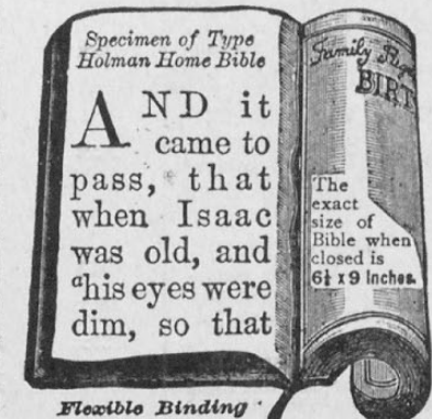
Specimen of Type Holman Home Bible

AND it came to pass, that when Isaac was old, and his eyes were dim, so that