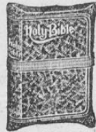
Size 5 1/4 x 3 1/2 inches.

The text is self-pronouncing, by whose aid children can learn to pronounce the difficult Scripture proper names.