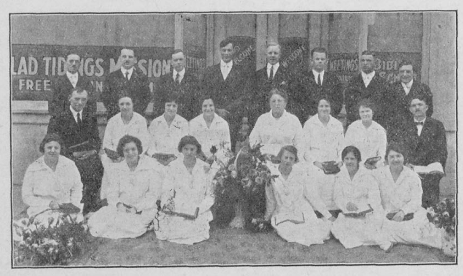
The Happy Glad Tidings Bible Institute Graduating Class, April 27, 1923.

"Only as the church fulfills her missionary obligation does she justify her existence."